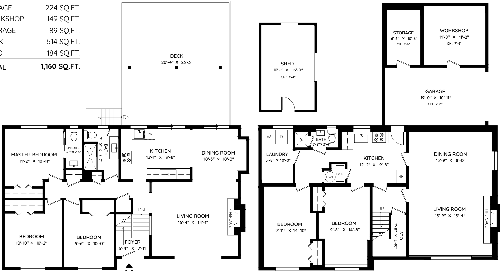
MAIN FLOOR 1,194 SQ.FT. CH: 8'-0"